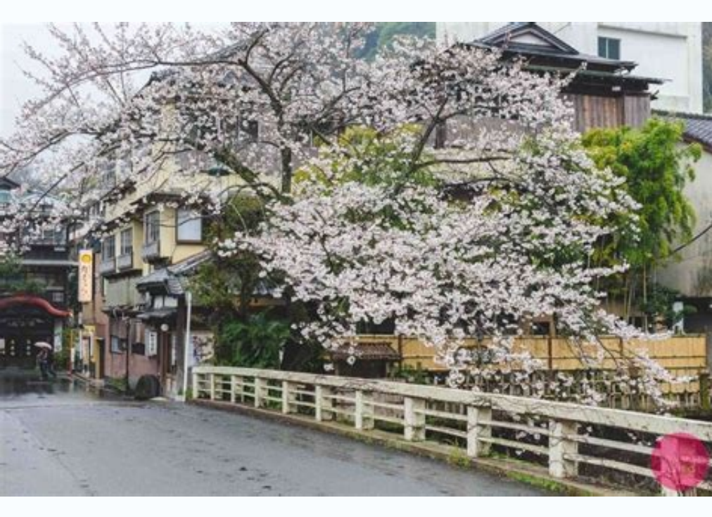
Japan guide onsen. Hakone guide. Japan guide hakone.

Budget: Yoshimatsu Surrounded by bamboo trees and hills, Yoshimatsu is a traditional Sukiya-style Ryokan (inn) with beautiful outdoor hot spring baths. Overlooking Mt. Fuji and Lake Ashi, it provides a free shuttle from Hakone Machi Bus Station. Fitted with tatami-mat flooring, these classic Japanese-style rooms are equipped with a flat-screen TV